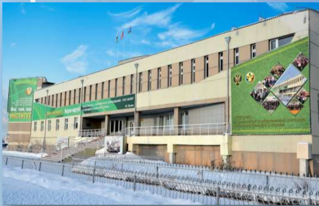
Educational and laboratory building