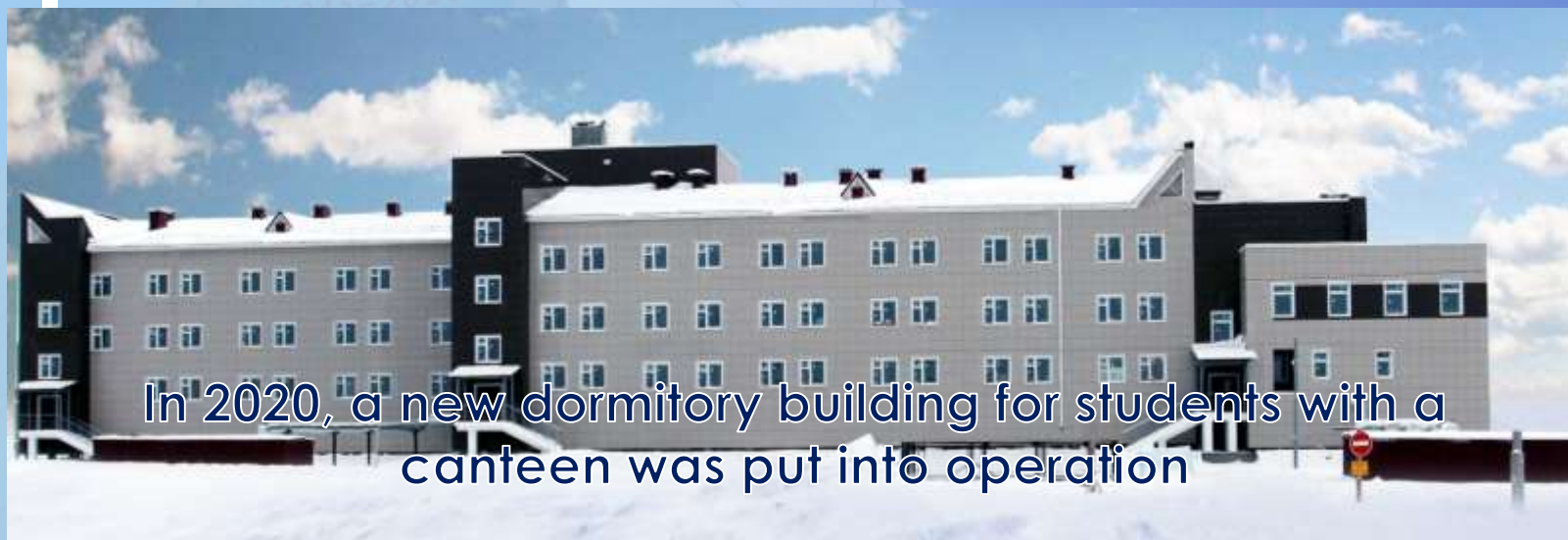
In 2020, a new dormitory building for students with a canteen was put into operation