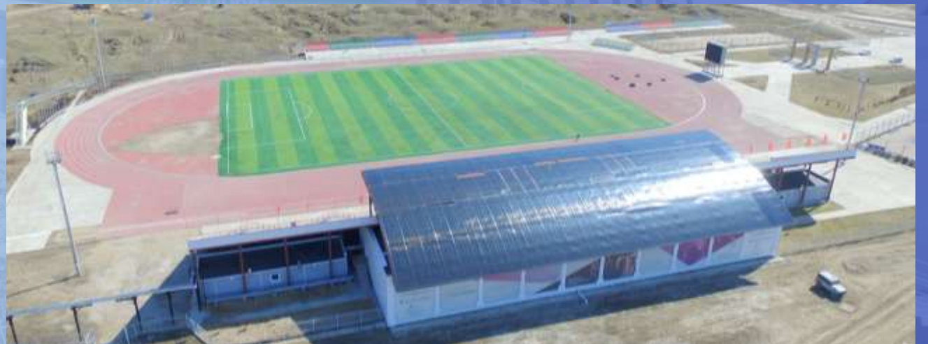
«Bootur Uus» Stadium with shooting range